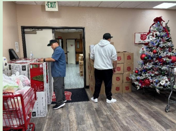
Volunteers loading food boxes & trees to be distributed.

An army of Salvation Army volunteers worked together for about three weeks to complete the distribution project. Volunteers came from The Salvation Army, their Adult Rehabilitation Center, Sober Living Facility, and other groups. Each family received an "Angel" bag of toys & clothes, along with a ham and a box of food. Thanks to Best Choice Products (BCP), almost every family was given one of their donated items—such as a wooden play kitchen set, a wooden play doctor office, or a foosball table.