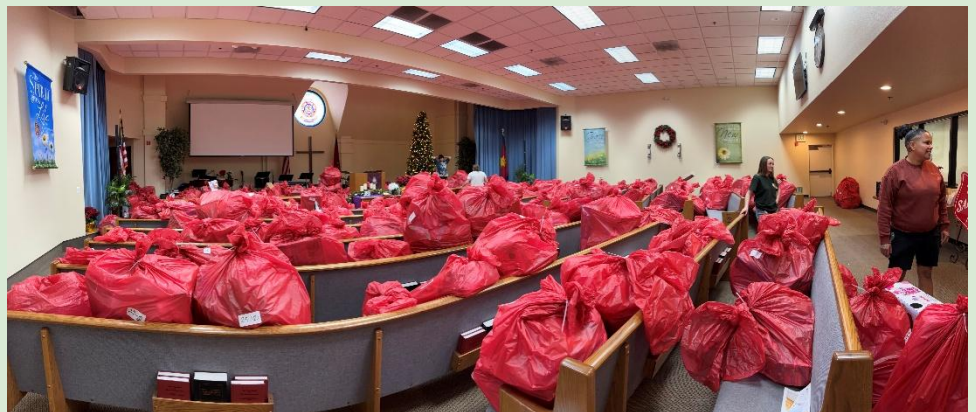
Angel bags labeled & ready for distribution to the families.