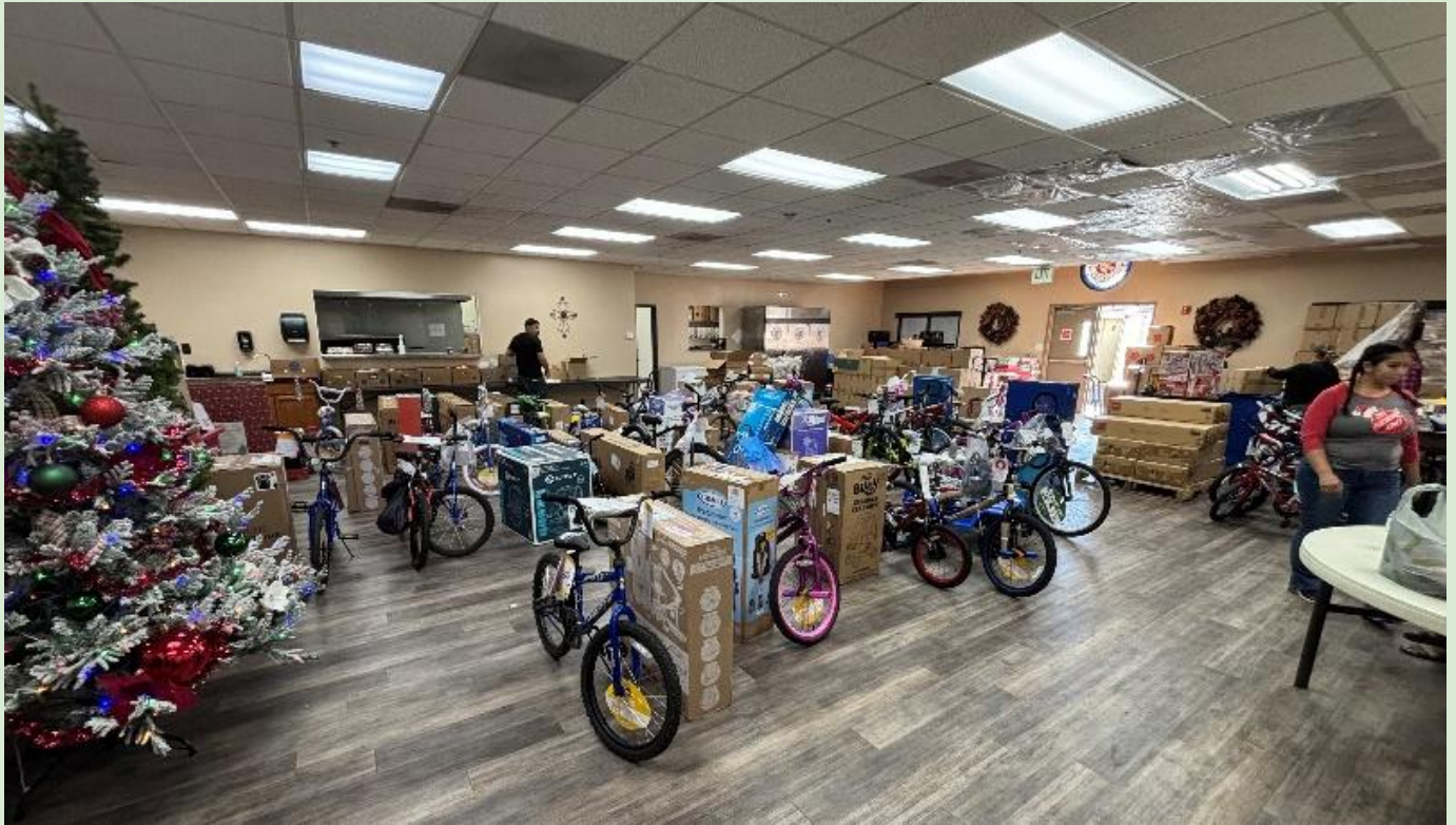
Bikes and toys ready in the other room for distribution.