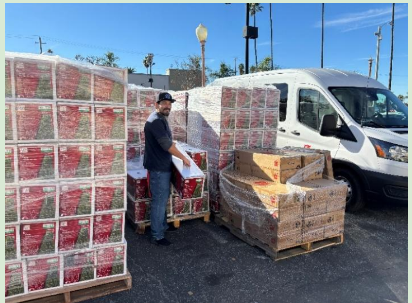
Christmas trees from Walmart & BCP toys stacked for distribution.

Walmart contributed 1,000 artificial, lighted Christmas trees, ensuring every family got one. Any leftover donated trees will be sold at The Salvation Army's Thrift Store, with proceeds supporting their Adult Rehab Program. At the end of the day, any remaining toys are saved for next year or donated to another Salvation Army Corps in a neighboring community.