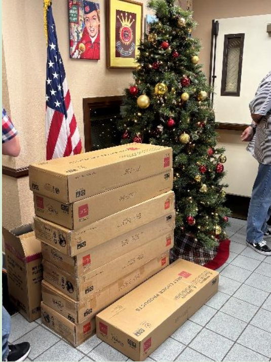
Some of the BCP toys being distributed.

An army of Salvation Army volunteers worked together for about three weeks to complete the distribution project. Volunteers came from The Salvation Army, their Adult Rehabilitation Center, Sober Living Facility, and other groups. Each family received an "Angel" bag of toys & clothes, along with a ham and a box of food. Thanks to Best Choice Products (BCP), almost every family was given one of their donated items—such as a wooden play kitchen set, a wooden play doctor office, or a foosball table.