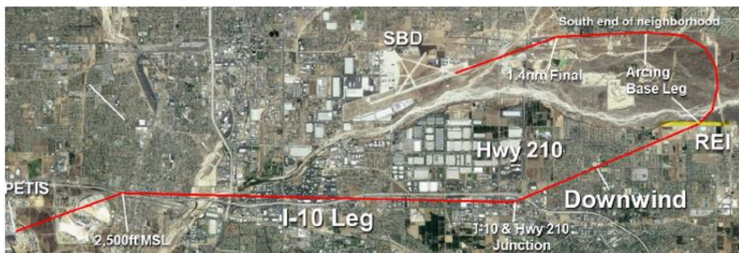
Lateral track for Visual to Runway 24 (as flown). Downwind leg at 2500 MSL.