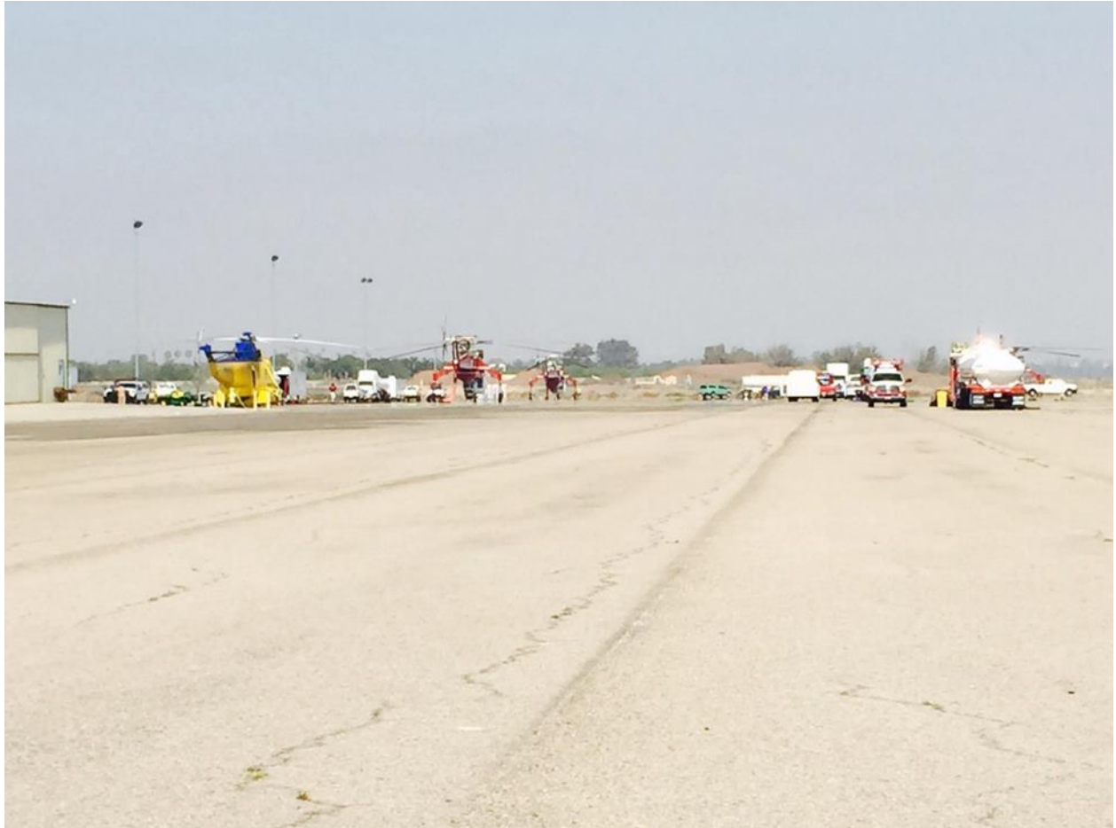
US Forest Service Aerial Fire Fighting Staging Area at Redlands Municipal Airport on 6/21/15